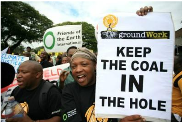
George Monbiot calculates that to have a decent chance of containing global warming to 2°C, we can only burn one third of conventional fossil fuel reserves at most, before 2050.

Friends of the Earth aims to support communities opposing extractive industries. As part of our 2012 programme, we plan to organise a series of talks around the country with our colleagues from Friends of the Earth International.