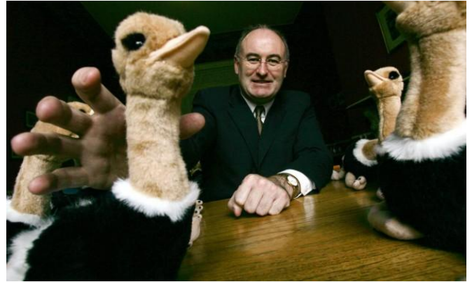
Phil Hogan says he wants to hear from you. Better make it quick.

The Government is holding a public consultation on climate policy ahead of drafting the climate Bill. Friends of the Earth supporters have actively participated in previous public consultations and we know it makes a real difference to the outcome. This time it's more important than ever that your views are represented. The Minister has said he wants the consultation to be inclusive and we'll be encouraging as many people as possible to take part.