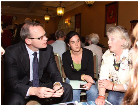
Constituents press Simon Coveney at the Stop Climate Chaos mass lobby in 2010.