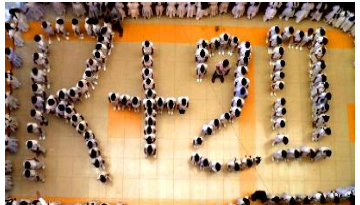
The first UN treaty on climate change was agreed in Rio de Janeiro in 1992. 20 years on, it's time to keep the promise to avoid dangerous climate change.

The UN Conference on Sustainability will take place in Rio de Janeiro this June where Heads of State, participants from the private sector and NGOs will convene to discuss how to build a green economy in the context of sustainable development and poverty eradication. Alongside our partners in Stop Climate Chaos, Friends of the Earth will work to engage and inform the public about the potential of the Earth Summit for climate action, and its challenges.